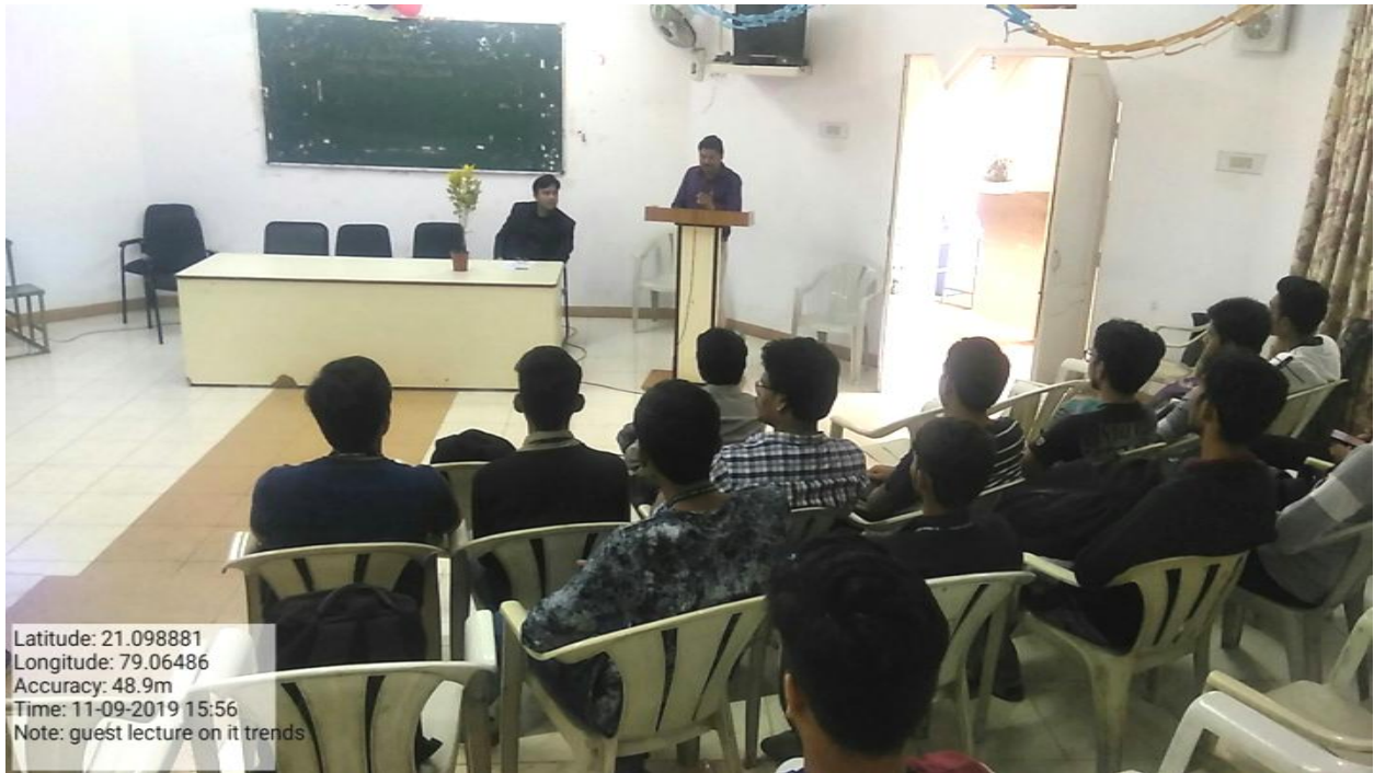
Latitude: 21.098881 Longitude: 79.06486 Accuracy: 48.9m Time: 11-09-2019 15:56 Note: guest lecture on it trends