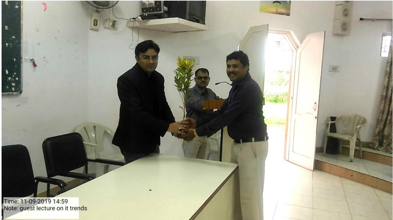
Time: 11-09-2019 14:59 Note: guest lecture on it trends